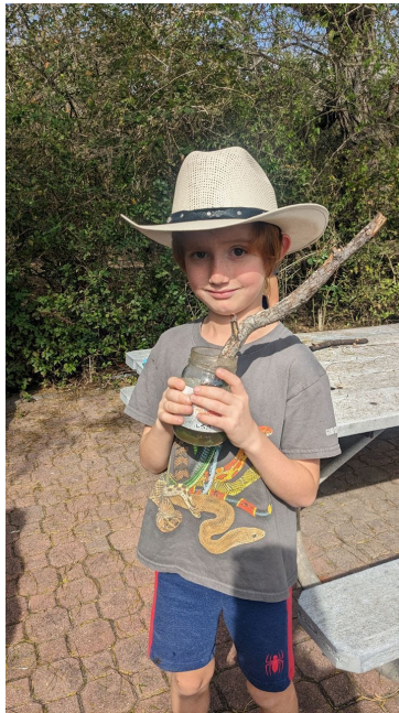
Friends Science Series: Native Plants- Medicinal, Wildlife, and Historical Uses